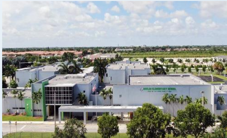
Goulds Elementary School is a Title I School.

Federal guidelines require Title I schools to hold an Annual Parent Meeting About the Benefits of the Title I Schoolwide Program to inform parents of Title I requirements and discuss their rights to be involved in the Title I Schoolwide Program.